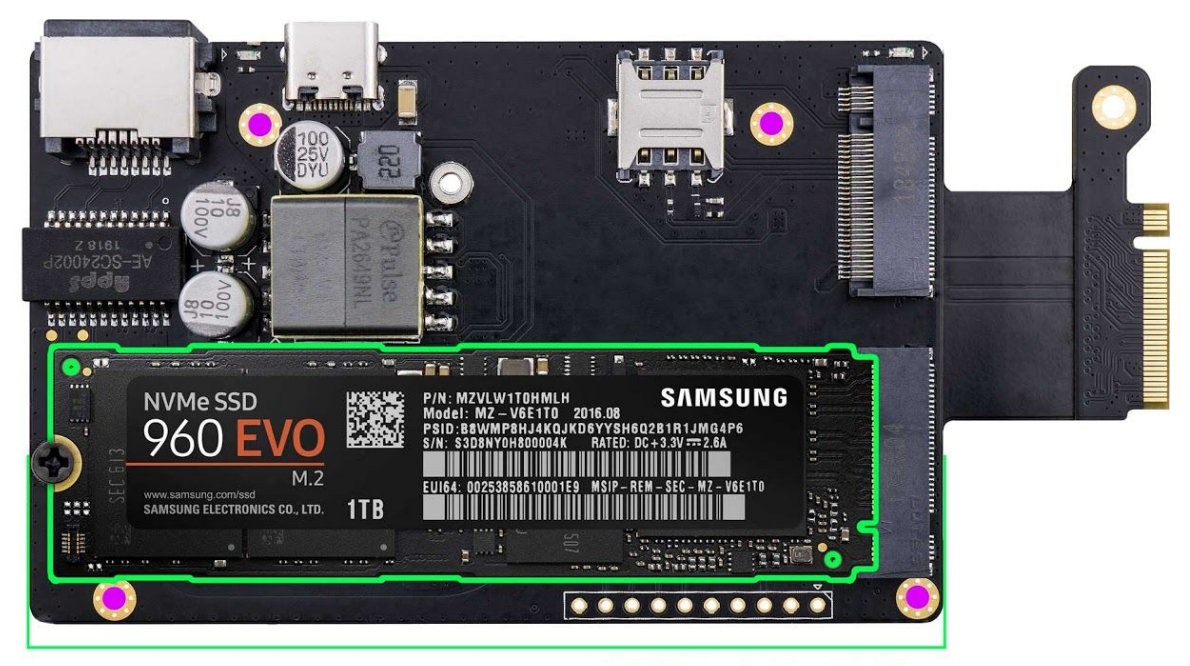
M2X Extension Board - 88mm

Why do Edge-V & VIM3 need an extension board for SSD drives?